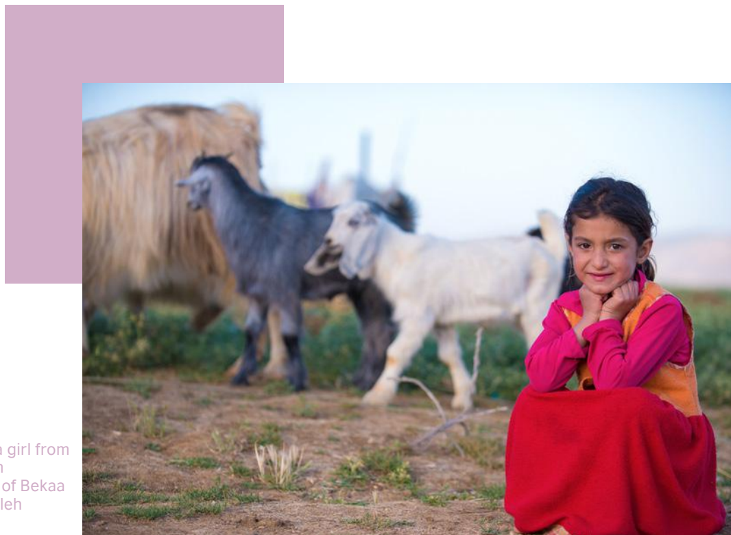
Portrait of a girl from the Bedouin community of Bekaa